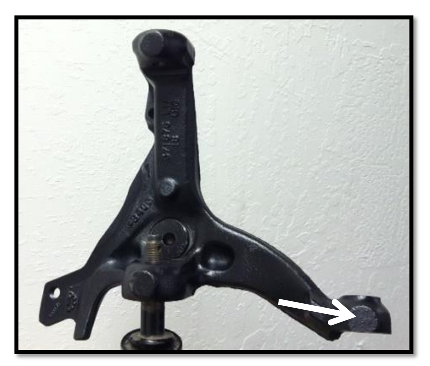
Figure 2: Strike tie rod end boss with large hammer (shown by arrow)

4. Strike the spindle at the ball joint boss to dislodge the ball joints. When the lower is loose, support the lower arm with a floor jack, strike the top and remove the nuts. Lift the upper control arm up and out of the way and lift the spindle off of the lower arm. See Figure 3 for reference.