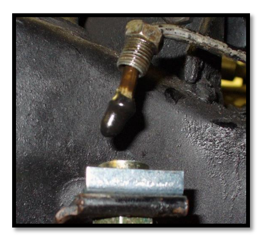
Figure 1: Hardline capped with vinyl cap